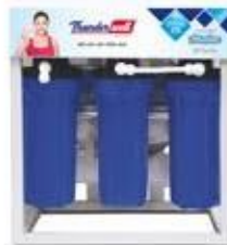
OMEGA-25 MRP : ₹ 24,900/-