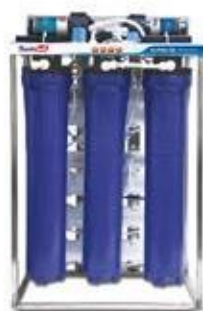
ALFA-50 MRP : ₹ 31,900/-