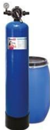
ELITE-100 MRP : ₹ 81,900/-