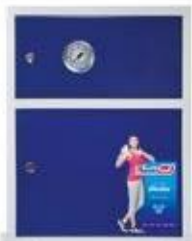
ELITE-25 MRP : ₹ 31,900/-