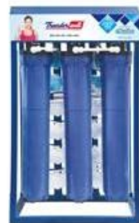
OMEGA-50 MRP : ₹ 39,900/-