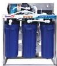
ALFA-25 MRP : ₹ 19,900/-