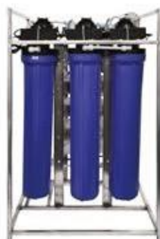
ALFA-100 MRP : ₹ 61,900/-